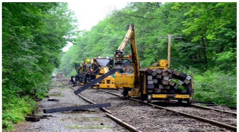
Rail Line Rehabilitation in Western Massachusetts