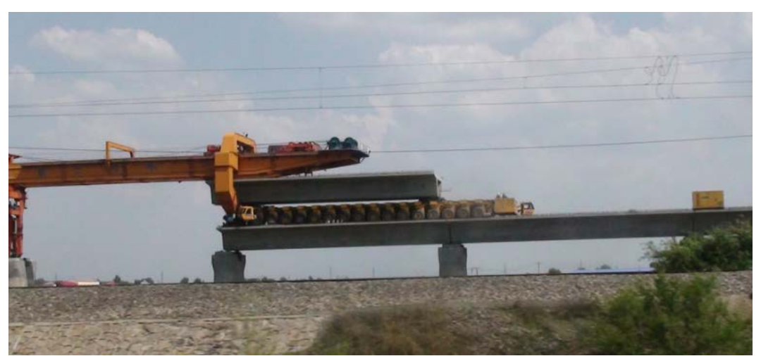
Figure 8-3: Gantry Crane System for Aerial Structure or Major Bridge Construction

Source: http://upload.wikimedia.org/wikipedia/commons/a/ab/Hada high-speed railway under const.JPG